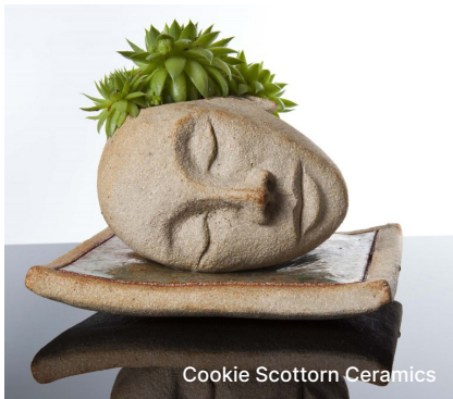
Cookie Scottorn Ceramics