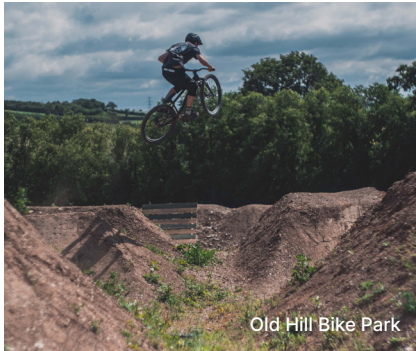
Old Hill Bike Park