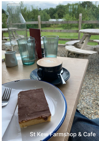
St Kew Farmshop & Cafe